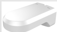
DS-2CD1294ZJ Wall mount